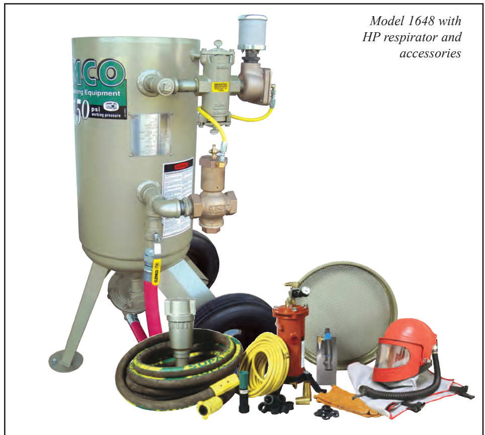
Model 1648 with HP respirator and accessories