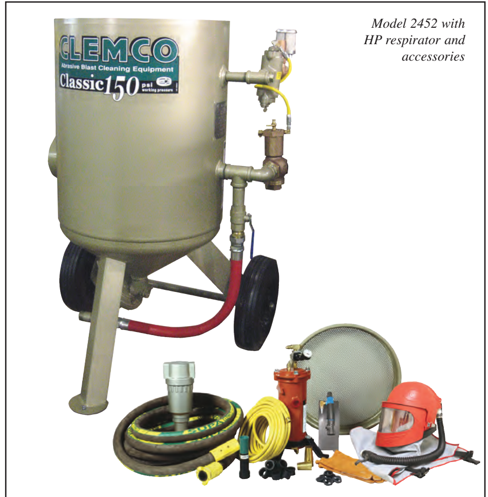
Model 2452 with HP respirator and accessories