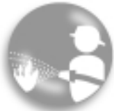
Fire and Rescue Safety